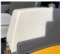
Antifreeze tank for water sprinkling piping