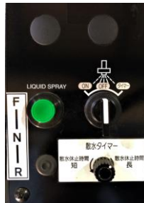
Switches for water spray, timer and liquid spray