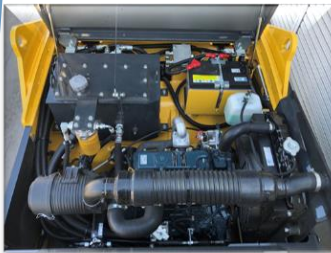
Arrangement of each device for easier maintenance