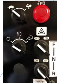
Switches for speed change, lighting and reverse buzzer