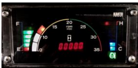
New instrument panel