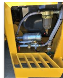
High durable impeller type sprinkling pump